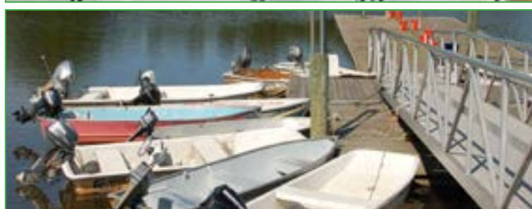
From bikes to boats, getting outdoors is easy in the Heritage Area. Join Maryland Milestones for a monthly bike ride or take a boat tour at Bladensburg Waterfront Park.

Prince George's County has a variety of great playgrounds, parks, and community sites. For example, Dinosaur Interpretive Site near Laurel allows fossil digging; Ellen Linson Pool/Wells Ice Rink in College Park a place to swim or skate; and Berwyn Heights' Indian Creek Playground has a Native American theme. All are operated by Maryland-National Capital Park and Planning Commission.