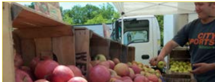
Today's agriculture takes a new spin with places like ECO City Farm in Edmonston and the Heritage Area's many farmer's markets - like Greenbelt's - bringing agriculture back to communities.

In the first half of the 20th century, the U.S. Department of Agriculture centralized their research facilities. At the USDA's Henry A. Wallace Beltsville Agricultural Research Center , researchers continue to pursue the innovations that help ensure a safe, steady, and affordable food supply. A piece of the original property has become the U.S. Fish and Wildlife Service Patuxent Wildlife Research Refuge , the only such research center in the United States. The National Wildlife Visitor Center provides visitor access to the site. Nearby, the National Agricultural Library is the largest facility of its kind in the world, with more than 2.3 million volumes on forty-eight miles of shelves.