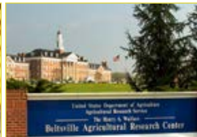
The Henry A. Wallace Beltsville Agricultural Research Center has led the way in innovations and developments for farming and food safety including development of the modern "Thanksgiving Turkey."